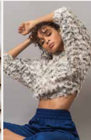
SPECIALTY ERI FABRICS FOR HAUTE COUTURE