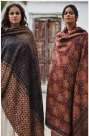
HANDSPUN HANDWOVEN ERI FABRIC IN NATURAL DYES

Having explored the promise of eri for more than a decade, from the fibre stage to end products, we are now poised to offer you unmatched technical know-how and unique products of this versatile silk for the future.