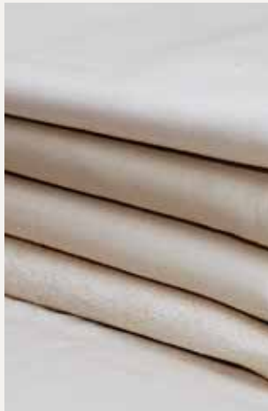
RFD FABRICS 100% ERI & ERI SILK BLENDS